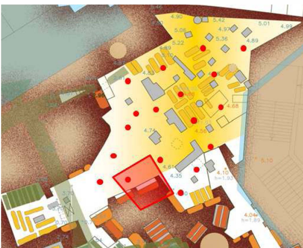
Fig. 1. Plan of the oratory with the scan positions highlighted (red dots)

The 3D data capture phase of the project took encountered the complex and fragmented structure of the space being surveyed. Particularities encountered were due to the presence of several pillars of pressed bricks, which support the ceilings, and the varying height of the ceiling. Specific considerations for this site focused on the need to document the recent excavations of the ground and wall tombs, the fresco palimpsests on the walls, the monumental inscriptions, and the graffiti of pilgrims.