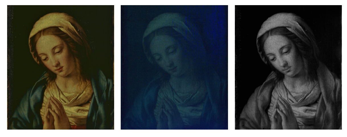
Three views of the painting Madonna in Preghiera, attributed to the workshop of Giovanni Battista Salvi da Sassoferrato: (left) visible-light photography, (center) ultraviolet fluorescence and (right) infrared reflectography.

o the casual museum visitor, a Stone Age clay pot, a Roman vase or an Old Masters painting might be interesting only because of how it looks on the surface. Specialists, however, know that a wealth of information lies beneath. Analyzing the layers of paint and supporting materials in a priceless artwork, for example, tells us how the artist built up translucent and opaque strata to achieve delicate visual illusions. Looking beneath the surface can yield clues to the artist's thought process: did the artist meticulously draw the design with a pencil or build up the picture from freehand brush strokes? Is the support structure beneath the outermost layers of paint or ceramic glaze robust, or could it be deteriorating?