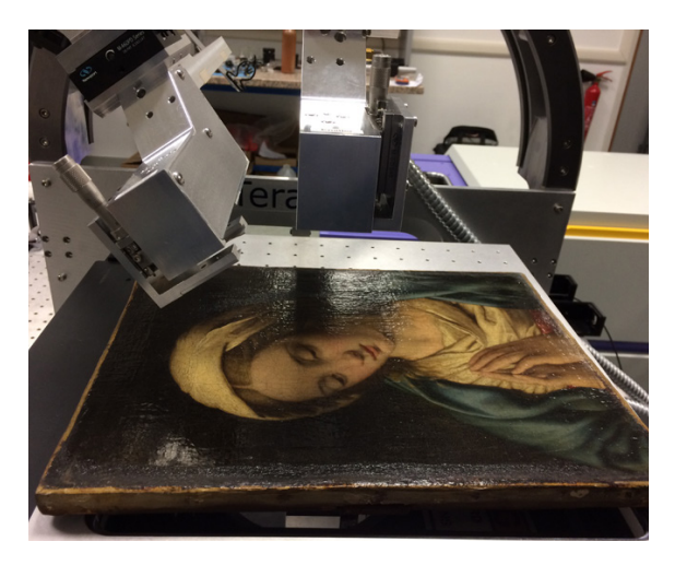
Terahertz imaging of the Madonna in Preghiera painting. Junliang Dong et al.

Once image acquisition is complete, scientists can slice and dice the results depending on their objectives. To build a 2-D image from the raw data, researchers can divide the data in three or more frequency ranges and construct false-color images in red, green and blue (with additional colors as needed), similar to multispectral imaging. Specialists in the field call these top planar views C-scans. Three-dimensional data can be converted into cross-sections, known as B-scans, for measuring thicknesses of layers of paint, varnish and other materials.