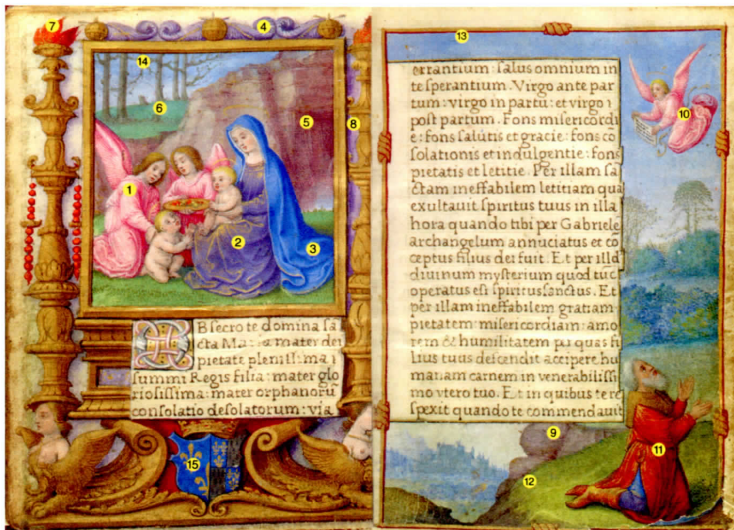
Fig. 77. Master of Claude de France, Virgin and Child with St. John the Baptist and Annunciation to Joachim , fols. 15v–16; Annunciation and Visitation , fols. 18v–19; and Trinity Adored by the Choirs of Angels , fols. 24v–25, from the Prayer Book of Claude de France, ca. 1515–17. New York, Morgan Library & Museum, MS M.1166.