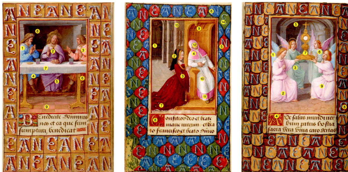
Fig. 74. Jean Poyer, Supper at Emmaus , fol. 8; Anne de Bretagne at Confession , fol. 10v; and Angels Displaying the Eucharist , fol. 11v, from the Prayer Book of Anne de Bretagne, ca. 1494. New York, Morgan Library & Museum, MS M. 50. The data points in yellow circles on Figs. 74–77 denote discrete areas of pigment examined for this study.

color options. Close analysis of their choices and the manner of their application can reveal each artist's signature style.