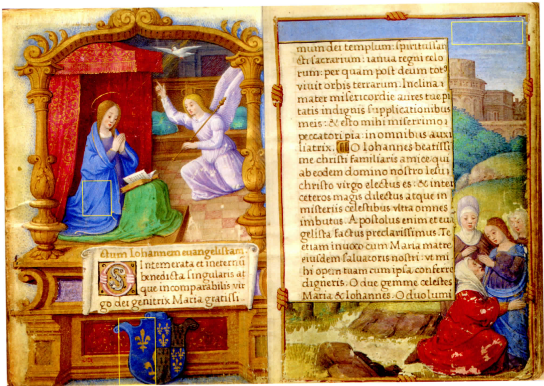
Fig. 80. The Master of Claude de France used ultramarine liberally to create a range of blues. Blue pigments in yellow boxes all contain ultramarine: Annunciation , with the coat of arms of Queen Claude de France in the lower border, and Visitation from the Prayer Book of Claude de France, ca. 1515–17. New York, Morgan Library & Museum, MS M.1166, fols. 18v–19.