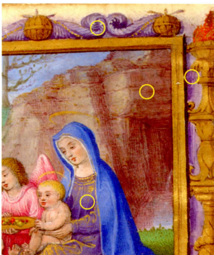
Fig. 83. The Master of Claude de France used a variation of four different tones of mercury-based pigments within a 2.3-centimeter square area: Virgin and Child with St. John the Baptist from the Prayer Book of Claude de France, ca. 1515–17. New York, Morgan Library & Museum, MS M.1166, fol. 15v (detail).

Many of the techniques and pigments used by the Claude Master are similar to those of his predecessors. It is in the extensive use of mercury-based pigments—vermilion, most likely—that he set himself apart. Poyer and Bourdichon used vermilion in the creation of their reds and oranges but not other colors. The Claude Master diverged from the traditional use of vermilion by mixing it into a