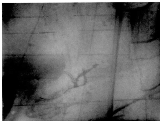
Fig. 78. Vidicon IR camera full-page image and close-up of kneeling figure. Poyer changed the angle of the foot from the original underdrawing to finished illuminated page, David and Uriah , from the Hours of Henry VIII, ca. 1500. New York, Morgan Library & Museum, MS H.8, fol. 108v.

tions with a bright purple pigment. More significantly, he used a bismuth-based pigment for the darker passages in his compositions. 5 Bismuth was not identified in any leaves by Poyer or the Claude Master. Bourdichon's palette provided a number of interesting contradictions when considered in the context of his formal reputation.