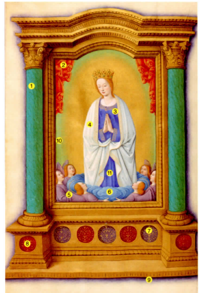
Fig. 76. Jean Bourdichon, Pentecost , fol. 29v; Presentation in the Temple , fol. 46v; and Assumption of the Virgin , fol. 56v, from the Holford Hours, ca. 1518. New York, Morgan Library & Museum, MS M. 732.