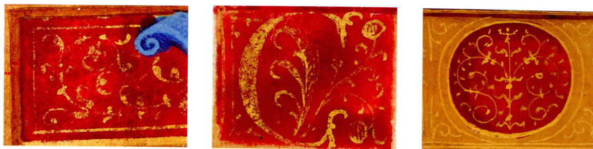
Fig. 82. XRF spectra for data point 8 was strikingly consistent. A rote mixture of red lead and azurite was used to decorate architectural devices. The image on the left is from the lower border of fol. 18v of the Prayer Book of Claude de France (see Fig. 77). The center image is from the initial C on fol. 10v of the Prayer Book of Anne de Bretagne (see Fig. 74). The image on the right is from the lower border of fol. 56v of the Holford Hours. (see Fig. 76).

Bourdichon, in the pages examined, did not employ light purple or pink shades. Poyer and the Claude Master did make extensive use of light tones of purple and pink. The similarities in palette are strong in MS M.50 for Poyer and MS M.1166 for the Claude Master. They are both trying to achieve a light tone. It is likely that they used organic lake pigments to attain this look. Organic dyes are not perceptible via XRF. There are large quantities of lead white and no other element in the light purples and pinks of MS M.50 and MS M.1166. The lack of other elements in the light purple and pinks leads to the conclusion that lake pigments were used to create the colors.