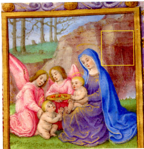
Fig. 81. The area in the yellow box is a brown hue that the Master of Claude de France created with the addition of vermilion: Virgin and Child with St. John the Baptist from the Prayer Book of Claude de France, ca. 1515–17. New York, Morgan Library & Museum, MS M.1166, fol. 15v (detail).

Poyer and Bourdichon used a mix of copper-containing azurite and red lead to achieve their dark purple colors. Bourdichon's signature purple outline is a mixture of azurite and red lead. The Claude Master's purples are very low in copper. He instead used mixtures of ultramarine and red lead for his purples. Additionally, in fol. 15v of MS M.1166, the purple palette extends into a brownish hue to depict rock formations in the landscape (Fig. 81). The Claude Master achieved this through the admixture of a mercury-based pigment. The remarkable variety of purple tones in MS M.1166 is one of the visually defining features of the Claude Master's style.